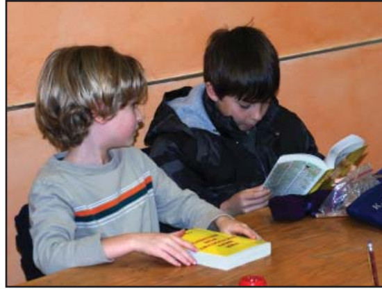
Looking for words