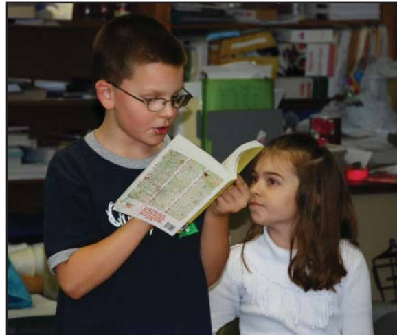
"I found it!"